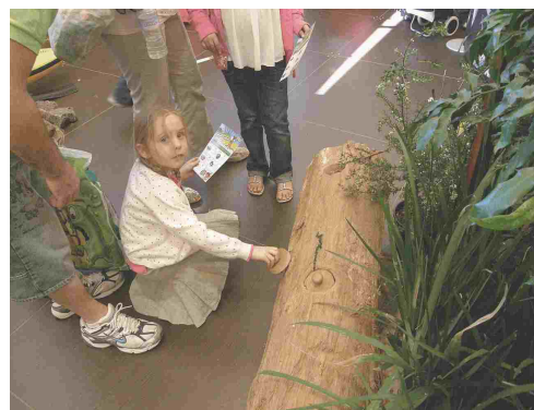
Looking for clues

and environmental stories. An invitation to join the Ranger Roo Club was part of the promotional hand-out. The Feature Creature Challenge was a great success with the children. Once they found the five animals (some hidden in a hollow log) and their corresponding information signs, an attending Ranger signed their qualifying certificate.