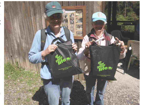
Proudly showing off the show bags