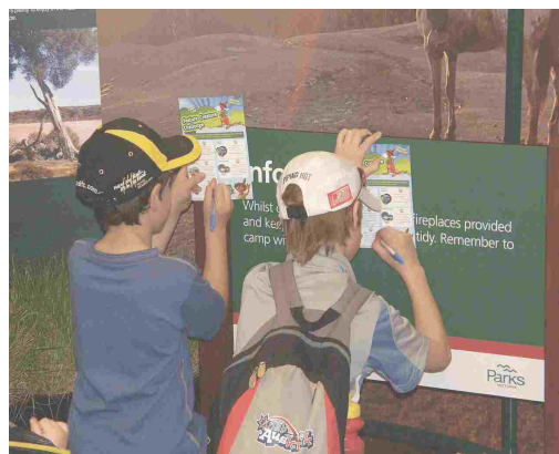
Filling in the sheets

and environmental stories. An invitation to join the Ranger Roo Club was part of the promotional hand-out. The Feature Creature Challenge was a great success with the children. Once they found the five animals (some hidden in a hollow log) and their corresponding information signs, an attending Ranger signed their qualifying certificate.