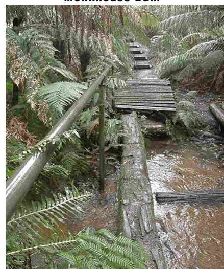
Clark Creek Bridge

There are many interesting sights to see at Gilwell Park, including the Camp Site Circle and the W. D. Kennedy Memorial Chapel.