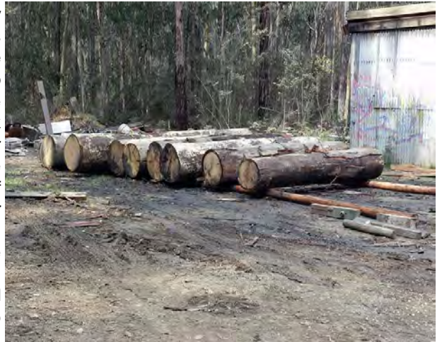
Logs ready to roll on the Mill

During June / July 2010 contractors installed new, huge concrete pipes to channel the Shepherds Creek deep down under Beenak Road. The Road was blocked off for almost four weeks. The trees that were felled were stacked beside the road before being taken to the Kurth Kiln depot.