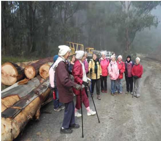
The logs at the Roadworks on 6 June

During June / July 2010 contractors installed new, huge concrete pipes to channel the Shepherds Creek deep down under Beenak Road. The Road was blocked off for almost four weeks. The trees that were felled were stacked beside the road before being taken to the Kurth Kiln depot.