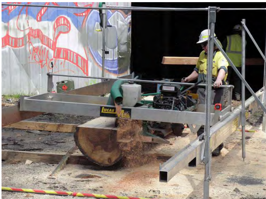
Rodney Stevens from Parks Victoria operating the mill

On 24 September we watched the Parks Victoria crew operating a "Lucas" portable Saw Mill at the depot, cutting the logs into planks for new picnic tables and bench tops. The steel frames for these had already been welded and drilled and were ready for assembly. It was fascinating to see the Mill in operation: The log is fixed to the ground, while the saw, complete with its motor, is mounted on a roller frame that glides effortlessly on supporting rails fixed to the ground either side for the length of the log.