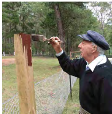
Painting the Heritage Fence at Kurth Kiln