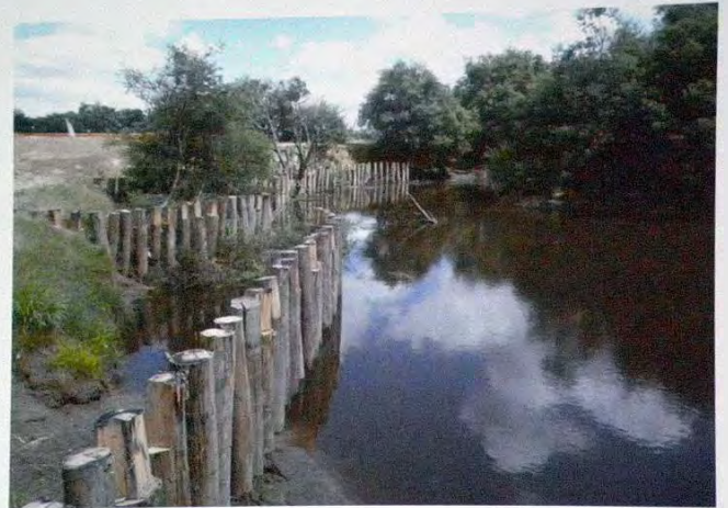
Completed pile fields

around corners. He is currently monitoring the ecological and stabilizing effect and long term durability of barriers made with wood-piles driven into the riverbed and of log-barriers, either natural or man-made, stabilising the embankments. Visiting one of the sites, we saw how the embedded logs were decelerating the water and that the river bank was starting to re-vegetate. One hundred metres downstream Dan pointed out a natural snag, a tree fallen in the river accumulating sediments and debris – a haven for fish life. Much thought must be given to ensure that the structures stay in place and do not wash down the Yarra.