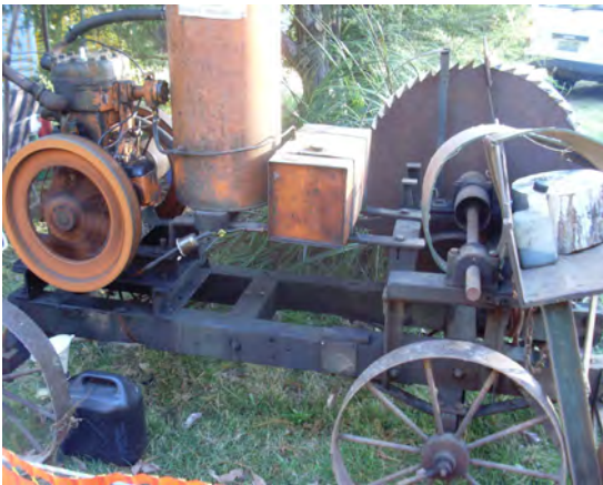
I have worked on our old 4hp Ronaldson Tippet petrol engine. It is now up and running, with a new Champion D21 spark plug.